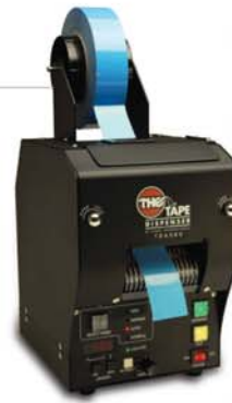
PROGRAMMABLE 5 LENGTH MEMORY