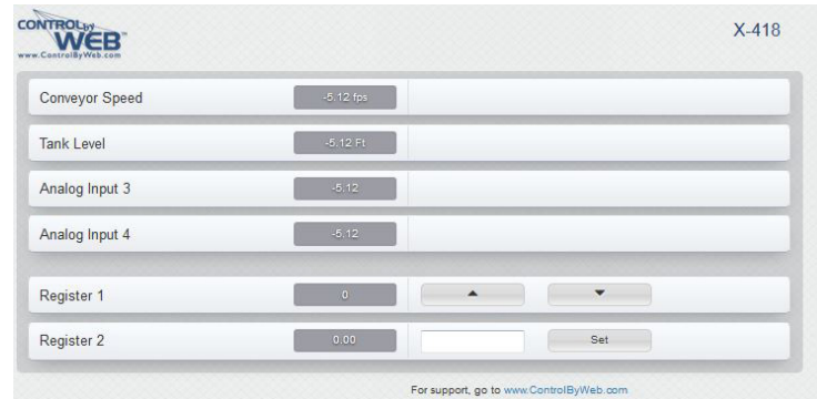
Example X-418 Control Page