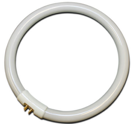
Replacement Bulb Item: BULB-T5