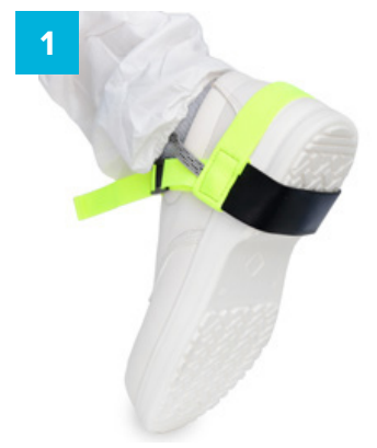
Remove Heel Grounder from its packaging and place the Black Conductive Rubber Strip on the heel grip of the shoe.