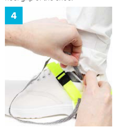
Feed the Grey Conductive Ribbon into the sock or shoe to complete the grounding path.