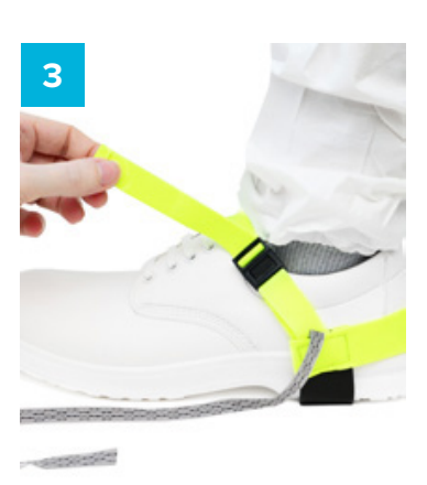
Push the Clip Fastener together to lock in place and pull the tail of the Neon Elastic Strap to tighten.