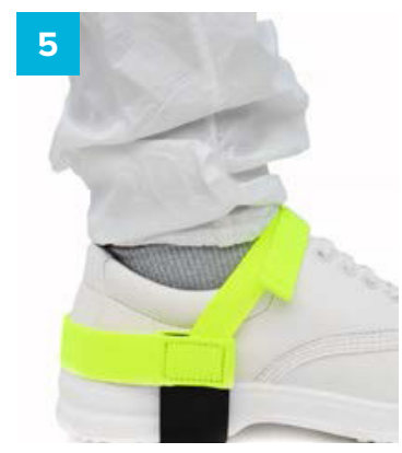
Inspect the Heel grounder for a secure and comfortable fit by gently tugging on the straps.