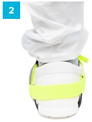
Place the Neon Elastic Strip at the back of the shoe.