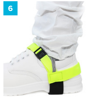
The footwear is now ready to be tested before entering a static sensitive area. Repeat with other shoe

To request a quotation or for more information, please call +44 (0)1473 836200 email sales@antistat.com or visit www.antistat.com