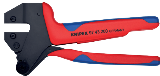
97 43 200 A MMM