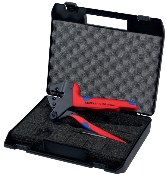
97 43 200 MMM