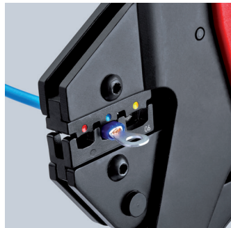
97 43 200 with crimping dies 97 49 06 for insulated terminals, plug connectors and butt connectors