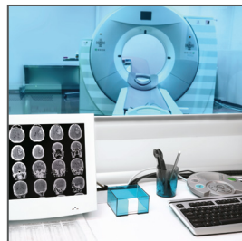
Medical Diagnostic Equipment