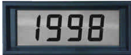
Snap-in Bezel Mount (Actual size)