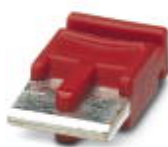
Single plug-in bridge, length: 6 mm, number of positions: 2, color: red

Single plug-in bridge - FBST 6-PLC RD - 2966236