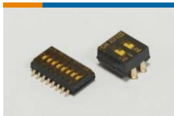
DIP & SIP Switches (256)