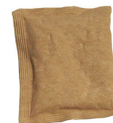
Desiccant in Kraft Pouch