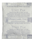
Desiccant in Tyvek® Pouch