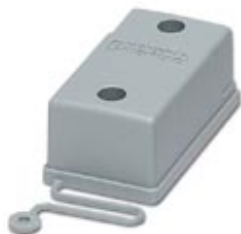
Protective cover, Protective covers, type: VC2, housing material: PA 6, color: gray

Please be informed that the data shown in this PDF Document is generated from our Online Catalog. Please find the complete data in the user's documentation. Our General Terms of Use for Downloads are valid ( http://phoenixcontact.com/download )