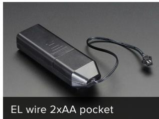
EL wire 2xAA pocket