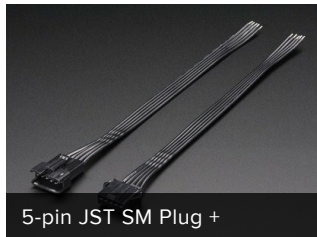
5-pin JST SM Plug +