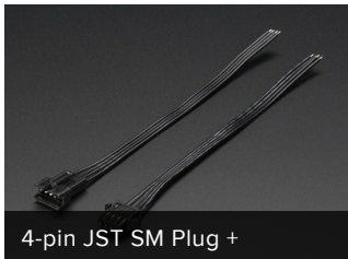
4-pin JST SM Plug +