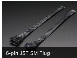
6-pin JST SM Plug +