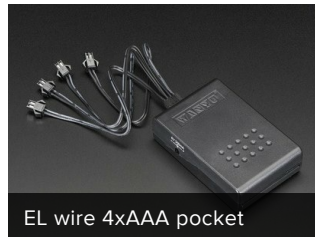
EL wire 4xAAA pocket