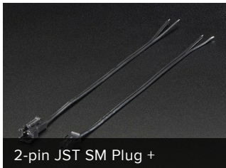
2-pin JST SM Plug +