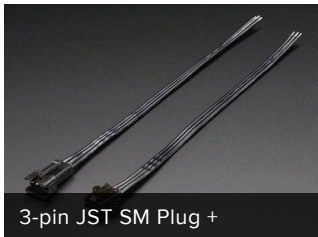
3-pin JST SM Plug +