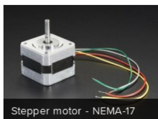
Stepper motor - NEMA-17