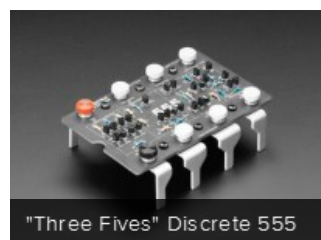
"Three Fives" Discrete 555