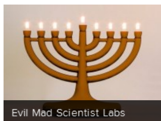
Evil Mad Scientist Labs