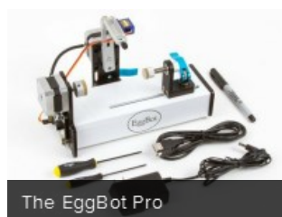
The EggBot Pro