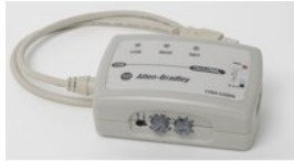
USB-to-DeviceNet Cable (1784-U2DN)

Home > Wired Analyzers > For use with NetDecoder software > DeviceNet-RAB