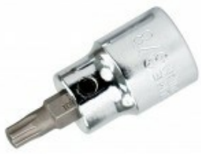
TorxPlus® Bit Socket 3/8" Square Drive