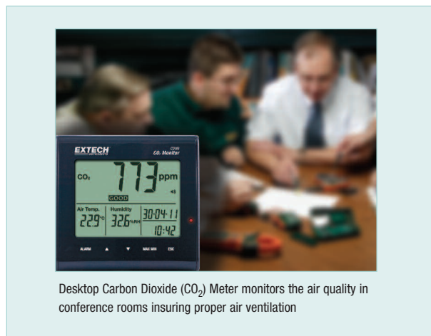
Desktop Carbon Dioxide (CO 2 ) Meter monitors the air quality in conference rooms insuring proper air ventilation