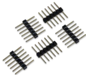
6-pin Header & Gender Changer (5-pack)