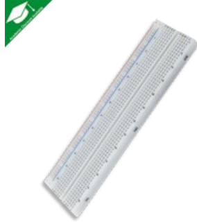
Solderless Breadboard Kit: Small