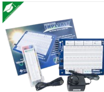
Electronics Explorer: All-in-one USB Oscilloscope, Multimeter & Workstation