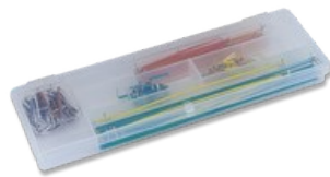
Breadboard Wire Kit