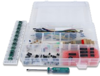
Analog Parts Kit by Analog Devices: Companion Parts Kit for the Analog Discovery