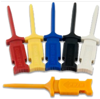
Mini Grabber Test Clips (6-pack) for use with Instrumentation Flywires