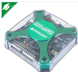
Analog Discovery 2: 100MS/s