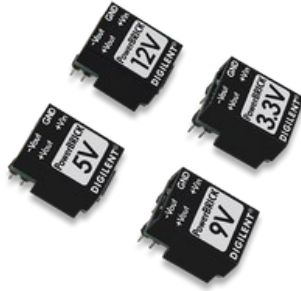
PowerBRICKS: Breadboardable Dual Output USB Power Supplies