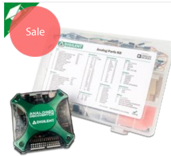
Analog Discovery 2 Student Bundle