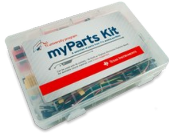
myParts Kit from Texas Instruments: Companion Parts Kit for NI myDAQ