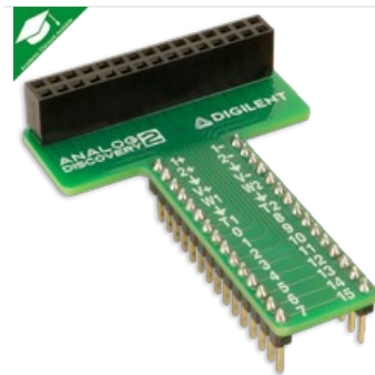
Breadboard Breakout for Analog Discovery