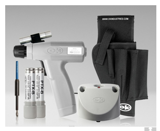
Click to Zoom

PTX-KIT1DHFL with Flashlight Attachment (battery included). PTX Battery Wire Wrapping Tools. The patented PTX Series of Wire Wrapping Tools bring a new level of wire wrapping proficiency to installers, telecom technicians and other users. This wire wrapping tool has a maximum usage rating of 2,500 cycles/day, will wire wrap 18 to 32 AWG wire and is available in both battery and electric models.