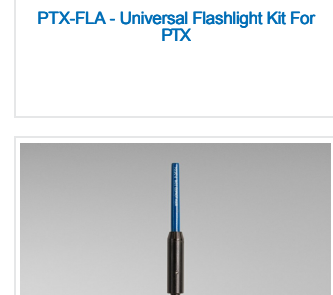
DFB224 - Wrap/Unwrap Bit & Sleeve Set, 22-24 AWG