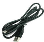
Mini USB cable 100cm