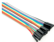
20 pin dual female splittable jumper wire - 300mm