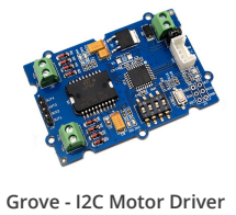
Grove - I2C Motor Driver