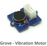
Grove - Vibration Motor