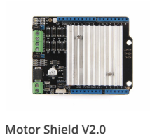
Motor Shield V2.0