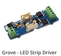
Grove - LED Strip Driver