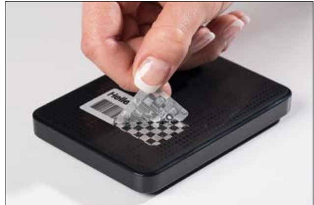
Highly visible tamper evidence.