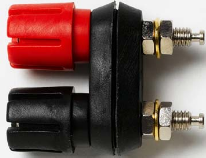
Model 6883 Dual Binding Posts