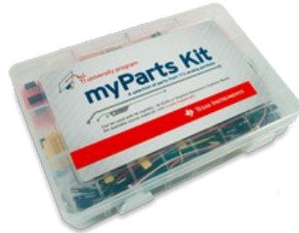
myParts Kit from Texas Instruments: Companion Parts Kit for NI myDAQ