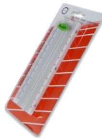
Solderless Breadboard Kit: Small