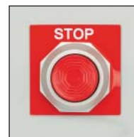
Raised Panel Labels