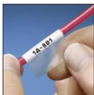
Wire and Cable Marking