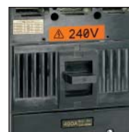
Electrical Hazard Labels