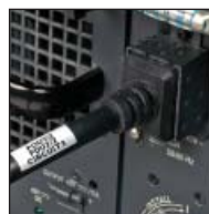
Electrical Infrastructure Labeling