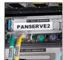
Network Infrastructure Labeling