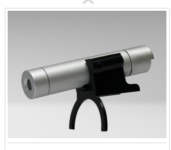
PTX-FLA - Universal Flashlight Kit For PTX