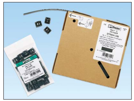
Dura-Ty™ Kit – Recyclable dispenser pack has through-hole for attaching to belt plus storage area for bag of heads