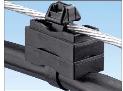
Stackable Aerial Cable Spacer – Designed for use in parallel or perpendicular applications with Dura-Ty™ Cable Ties