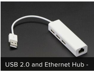
USB 2.0 and Ethernet Hub -