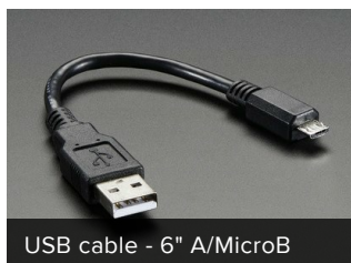
USB cable - 6" A/MicroB