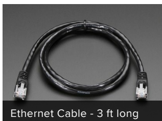
Ethernet Cable - 3 ft long