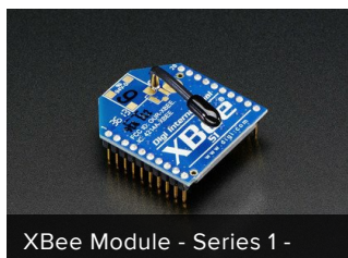
XBee Module - Series 1 -