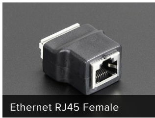
Ethernet RJ45 Female