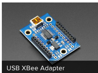
USB XBee Adapter