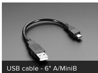
USB cable - 6" A/MiniB