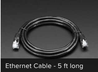
Ethernet Cable - 5 ft long