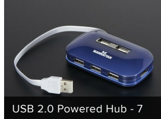
USB 2.0 Powered Hub - 7