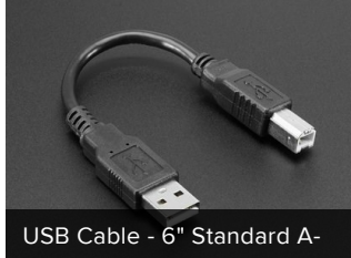
USB Cable - 6" Standard A-