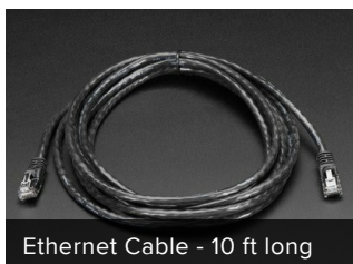
Ethernet Cable - 10 ft long