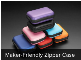
Maker-Friendly Zipper Case