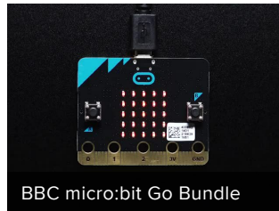
BBC micro:bit Go Bundle