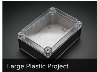
Large Plastic Project