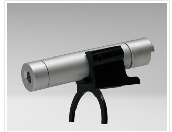
PTX-FLA - Universal Flashlight Kit For PTX