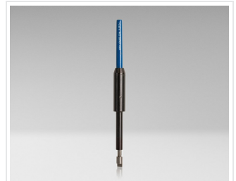
DFB224 - Wrap/Unwrap Bit & Sleeve Set, 22-24 AWG