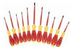
Insulated SlimLine Slotted, Phillips, Square and Xeno Screwdrivers 11 Piece Set