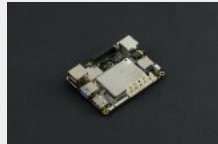
LattePanda - A Powerful Window.....