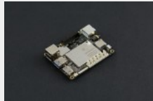
LattePanda - A Powerful Window.....