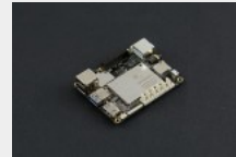
LattePanda 2GB/32GB - A Powerf.....