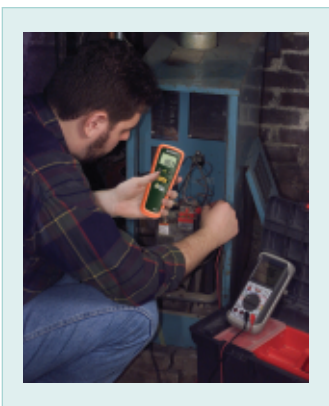
Ideal for performing service checks on furnaces and hot water heaters