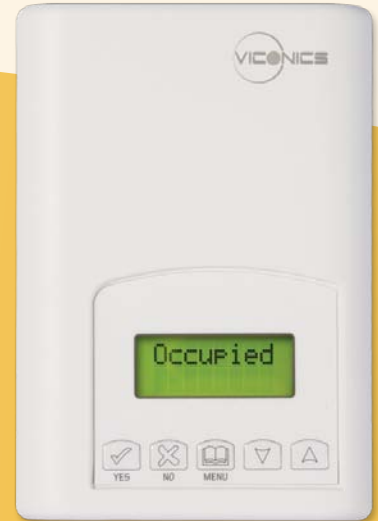
VT7682S Wireless Central Manager

For more information on this and other Viconics control solutions, please visit us at www.viconics.com