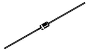
AXIAL LEAD DO35