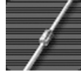
DO-204AH (DO-35 Glass)