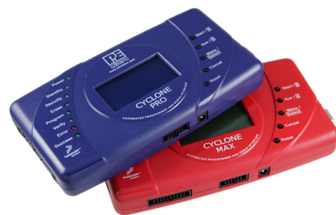
Cyclone PRO & Cyclone MAX

The USB Multilink Universal and Universal FX are intended for development and are not designed to accommodate the demands of production programming. However, P&E's Cyclone programmers are specifically engineered to withstand the rigors of a production environment and will provide a seamless transition from the Multilink. More information is available online at pemicro.com/cyclonepro and pemicro.com/cyclonemax .