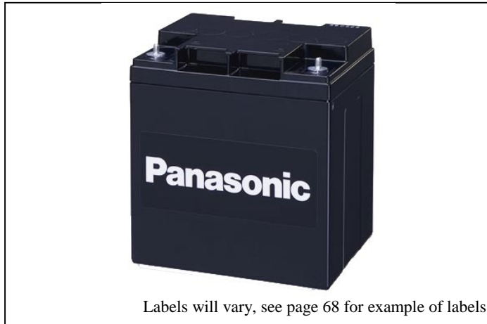
Labels will vary, see page 68 for example of labels.

(a) The photo and dimensions represent LC-X1228AP