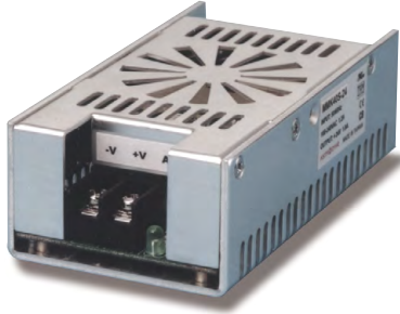
2.5"W x 4.75"L x 1.5"H