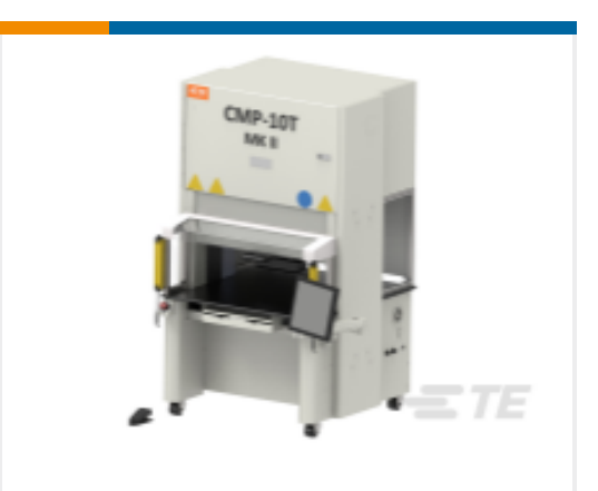
TE Part # CAT-CMP-10TMKII Connector Press Fit Machine