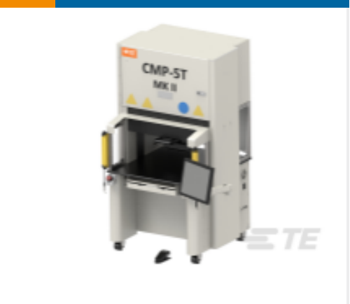
TE Part # CAT-CMP-5TMKII Connector Press Fit Machine CMP-5T MKII