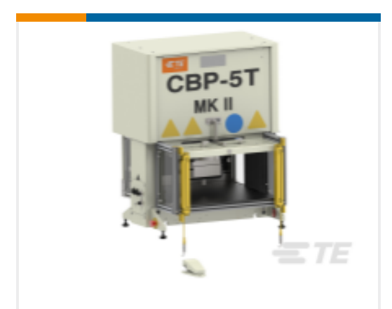
TE Part # CAT-CBP-5T CBP-5T MKII Benchtop Press - Servo Electric