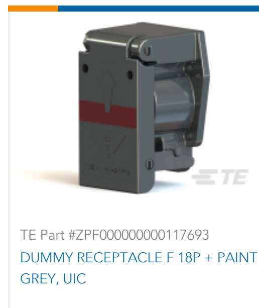
TE Part #ZPF000000000117693 DUMMY RECEPTACLE F 18P + PAINT GREY, UIC