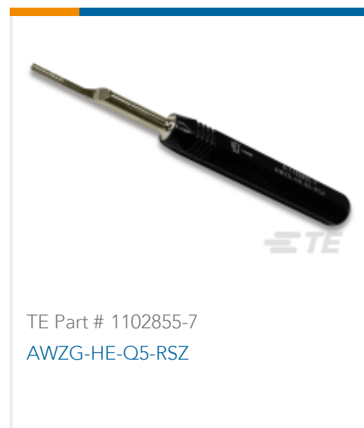
TE Part # 1102855-7 AWZG-HE-Q5-RSZ