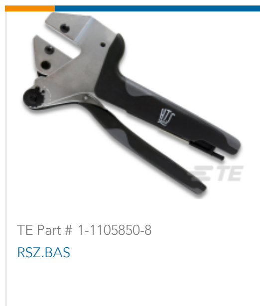
TE Part # 1-1105850-8 RSZ.BAS