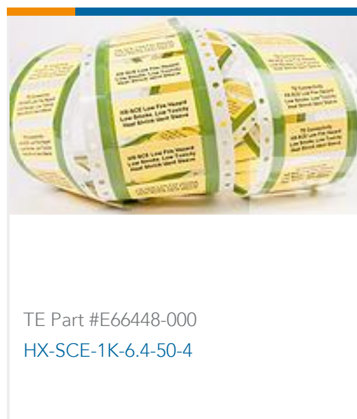
TE Part #E66448-000 HX-SCE-1K-6.4-50-4