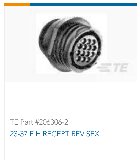
TE Part #206306-2 23-37 F H RECEPT REV SEX