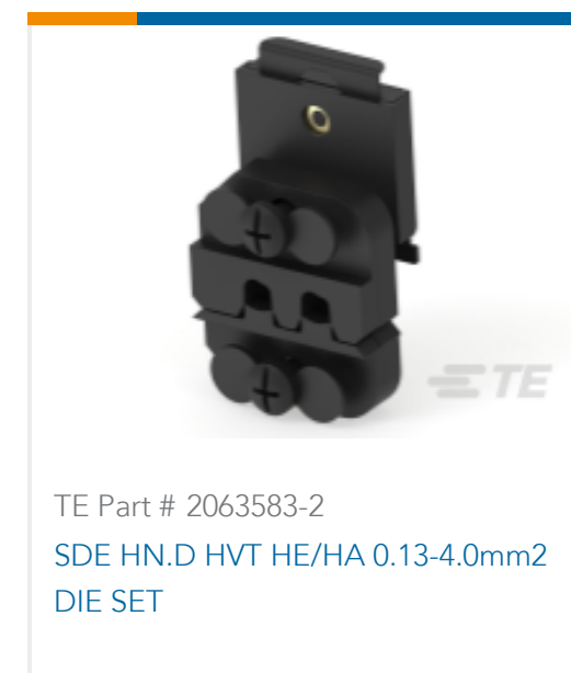
TE Part # 2063583-2 SDE HN.D HVT HE/HA 0.13-4.0mm2 DIE SET