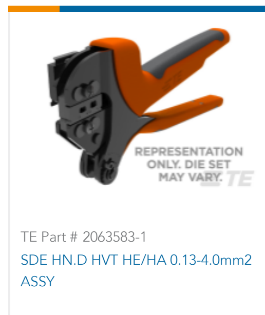
TE Part # 2063583-1 SDE HN.D HVT HE/HA 0.13-4.0mm2 ASSY