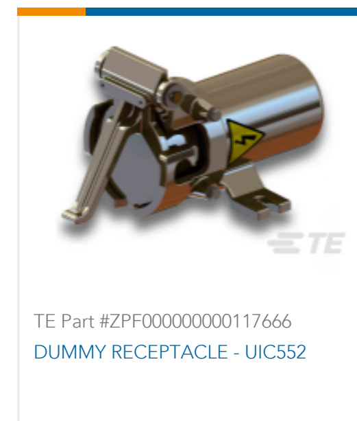
TE Part #ZPF000000000117666 DUMMY RECEPTACLE - UIC552