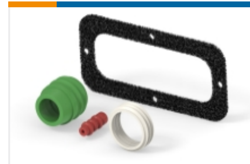
Connector Seals & Cavity Plugs(5)