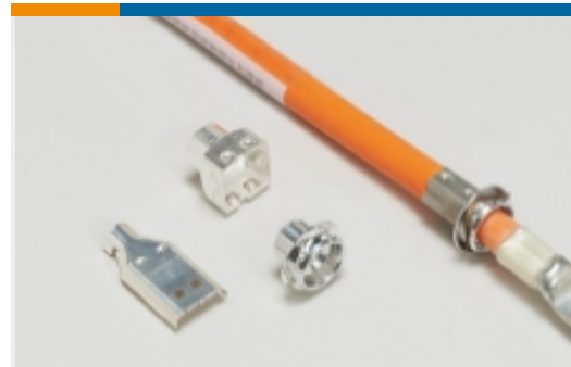
Automotive Connector EMC Shielding (4)