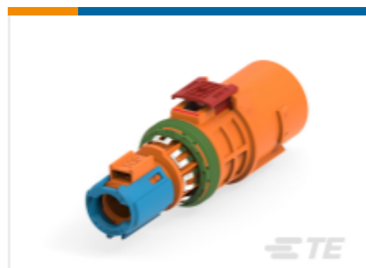
TE Part #2394085-2 Housing for Female Terminals HVP-HD 1000