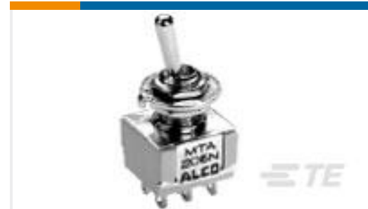
TE Part #2-1437558-0 MTA206N=(MSTA) SW TOG DPDT