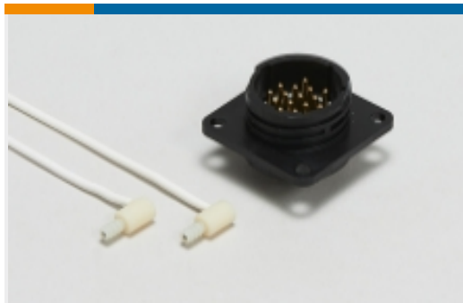
Circular Power Connectors(91)