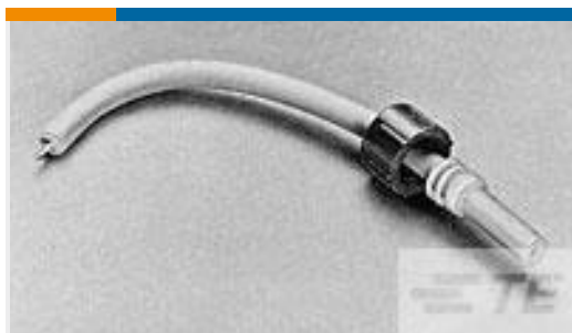
TE Part #1-839564-3 LEAD, SGL END ASSY, LGH