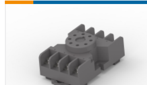
TE Part #2-1419106-3 27E891=SOCKET,KRPA,8,OCTAL,POL