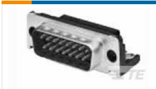
TE Part #5747238-6 25 MSFL PLUG RA 318 (SL,FM)