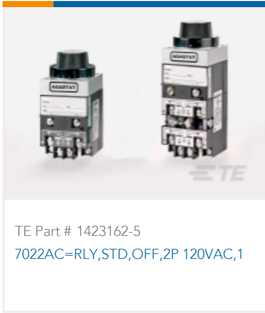
TE Part # 1423162-5 7022AC=RLY,STD,OFF,2P 120VAC,1