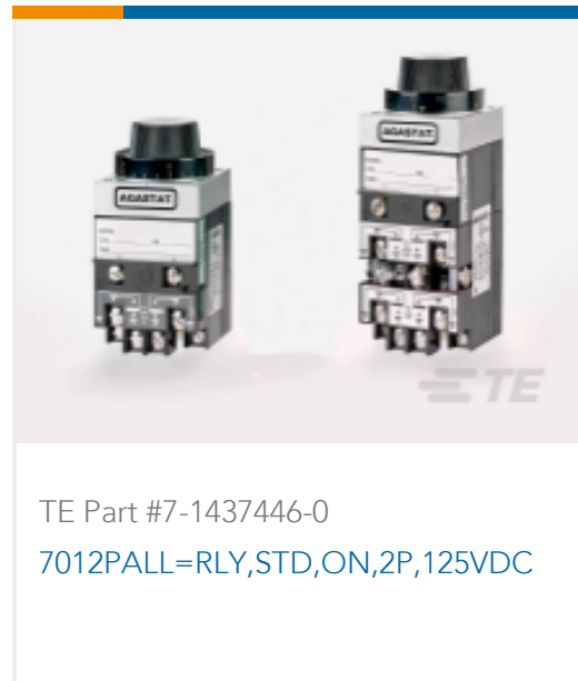
TE Part #7-1437446-0 7012PALL=RLY,STD,ON,2P,125VDC