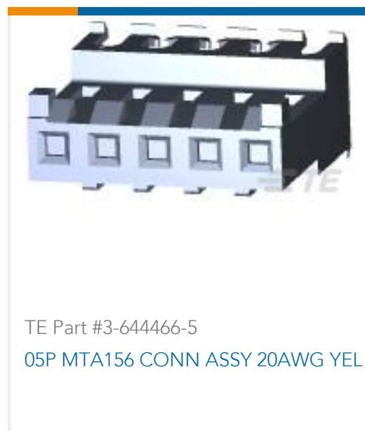
TE Part #3-644466-5 05P MTA156 CONN ASSY 20AWG YEL