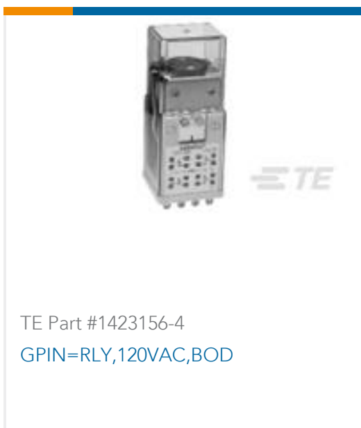
TE Part #1423156-4 GPIN=RLY,120VAC,BOD