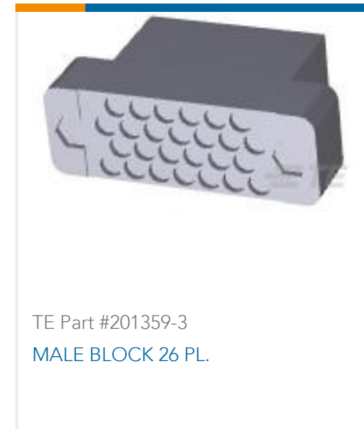
TE Part #201359-3 MALE BLOCK 26 PL.