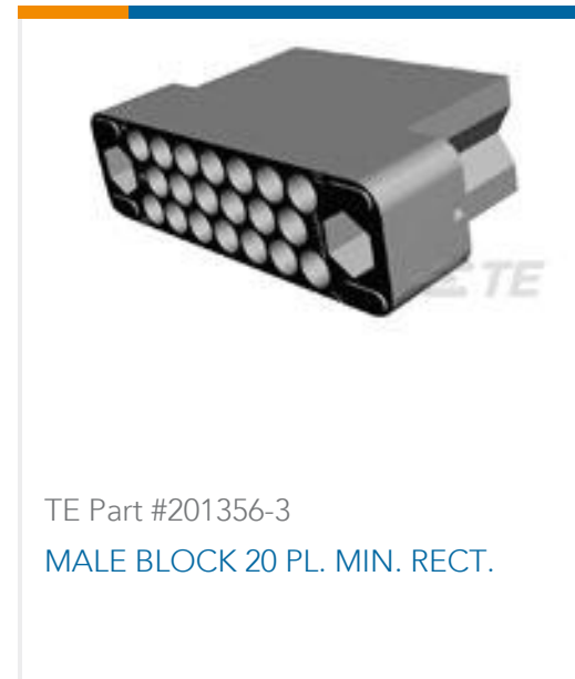
TE Part #201356-3 MALE BLOCK 20 PL. MIN. RECT.