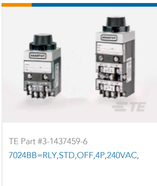
TE Part #3-1437459-6 7024BB=RLY,STD,OFF,4P,240VAC,