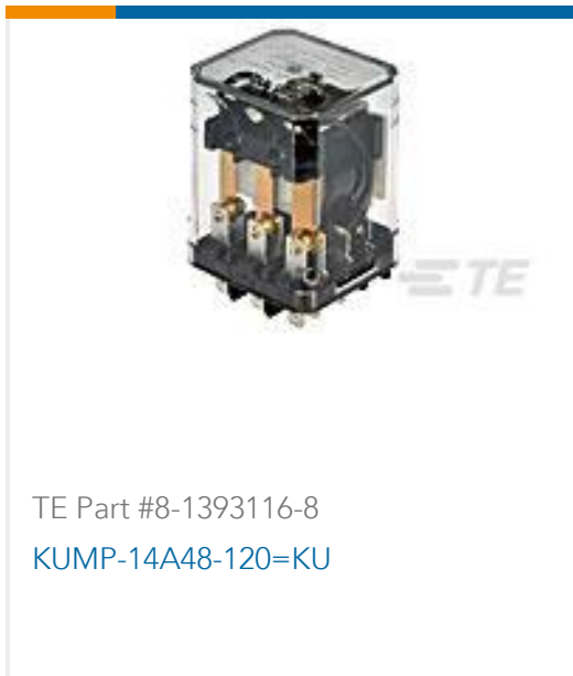
TE Part #8-1393116-8 KUMP-14A48-120=KU