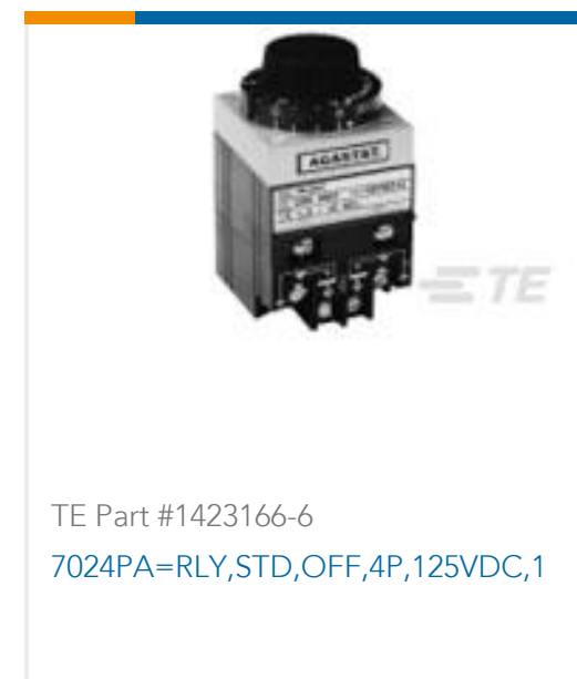
TE Part #1423166-6 7024PA=RLY,STD,OFF,4P,125VDC,1