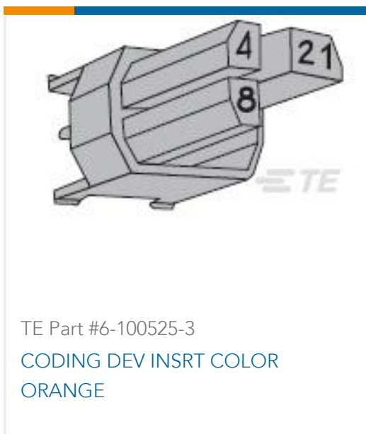
TE Part #6-100525-3 CODING DEV INSRT COLOR ORANGE