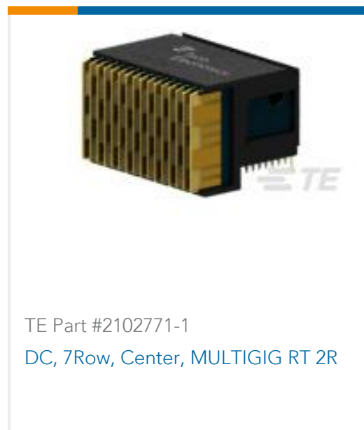
TE Part #2102771-1 DC, 7Row, Center, MULTIGIG RT 2R