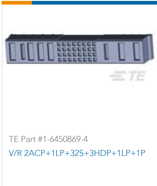
TE Part #1-6450869-4 V/R 2ACP+1LP+32S+3HDP+1LP+1P