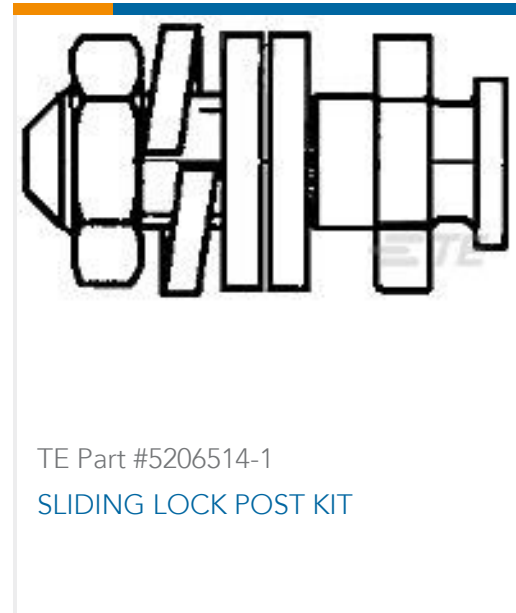
TE Part #5206514-1 SLIDING LOCK POST KIT