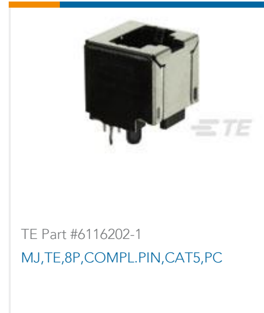
TE Part #6116202-1 MJ,TE,8P,COMPL.PIN,CAT5,PC