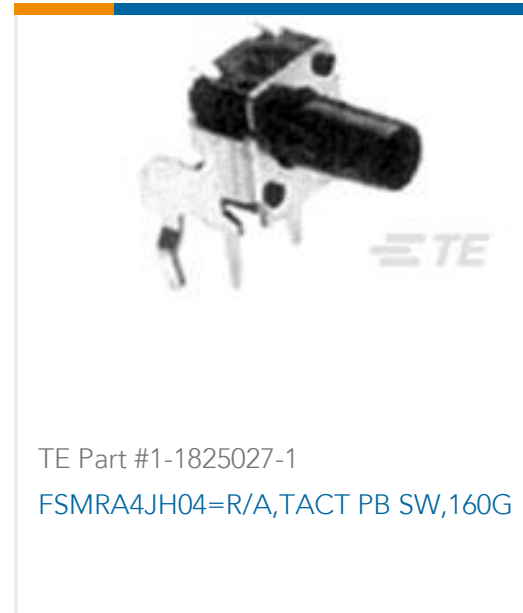
TE Part #1-1825027-1 FSMRA4JH04=R/A, TACT PB SW, 160G