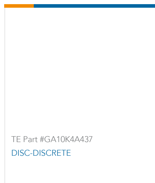
TE Part #GA10K4A437 DISC-DISCRETE