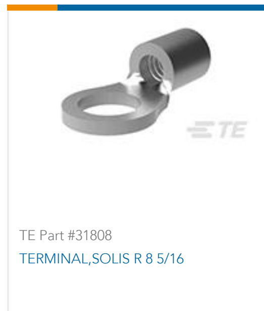
TE Part #31808 TERMINAL, SOLIS R 8 5/16