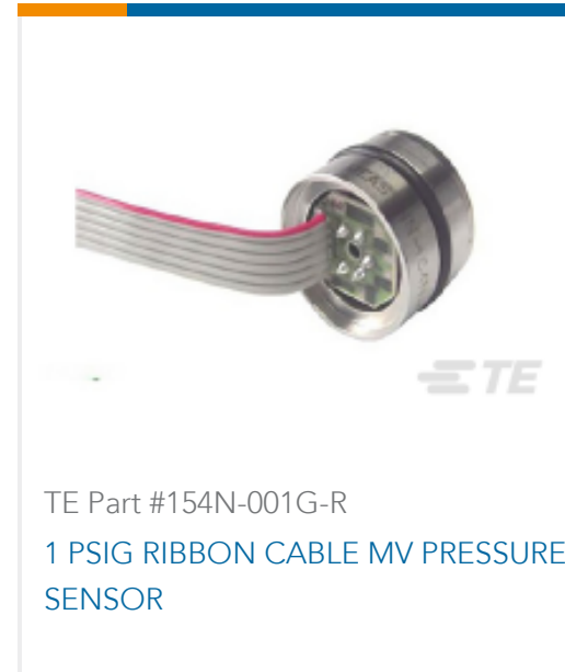
TE Part #154N-001G-R 1 PSIG RIBBON CABLE MV PRESSURE SENSOR