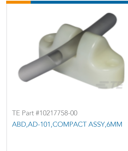
TE Part #10217758-00 ABD, AD-101, COMPACT ASSY, 6MM