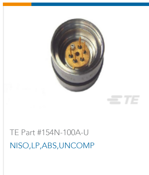
TE Part #154N-100A-U NISO, LP, ABS, UNCOMP