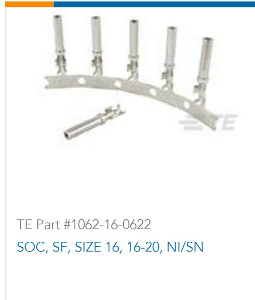
TE Part #1062-16-0622 SOC, SF, SIZE 16, 16-20, NI/SN