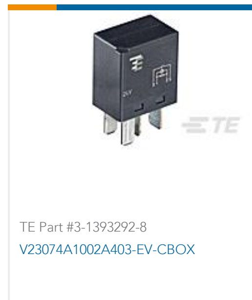
TE Part #3-1393292-8 V23074A1002A403-EV-CBOX