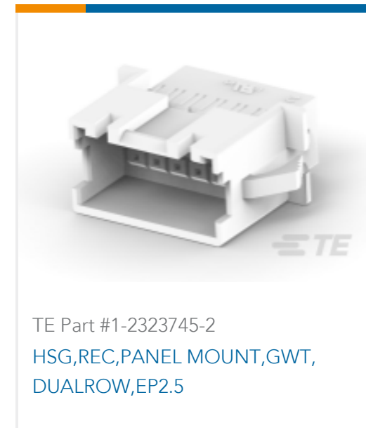
TE Part #1-2323745-2 HSG,REC,PANEL MOUNT,GWT, DUALROW,EP2.5