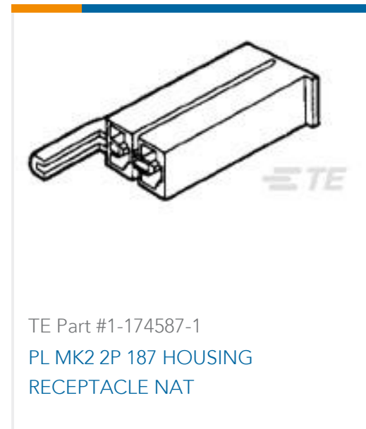
TE Part #1-174587-1 PL MK2 2P 187 HOUSING RECEPTACLE NAT