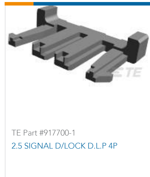
TE Part #917700-1 2.5 SIGNAL D/LOCK D.L.P 4P