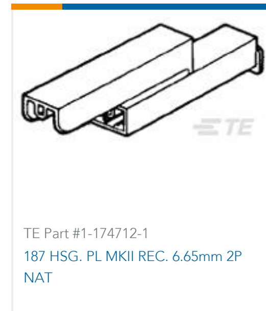
TE Part #1-174712-1 187 HSG. PL MKII REC. 6.65mm 2P NAT