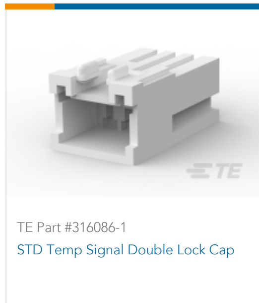
TE Part #316086-1 STD Temp Signal Double Lock Cap