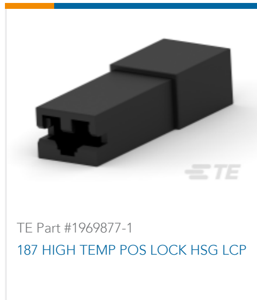
TE Part #1969877-1 187 HIGH TEMP POS LOCK HSG LCP