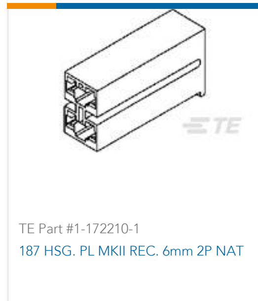
TE Part #1-172210-1 187 HSG. PL MKII REC. 6mm 2P NAT