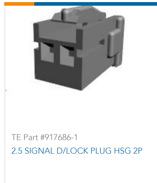
TE Part #917686-1 2.5 SIGNAL D/LOCK PLUG HSG 2P