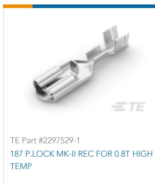
TE Part #2297529-1 187 P.LOCK MK-II REC FOR 0.8T HIGH TEMP