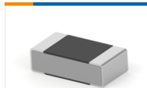
TE Part #8-1879140-5 RN 0603 140K 0.1% 10PPM 5K RL