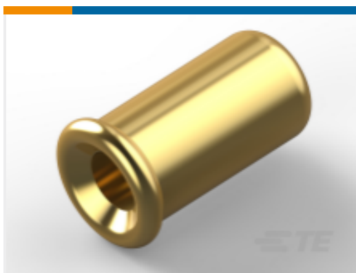
TE Part # 1-332070-4 SOCKET,MIN-SPR W/H AU SER-4