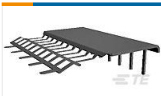
TE Part #338108-2 Z-PACK SHLD.LOWER A