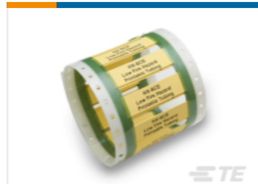
TE Part #D14525-000 HX-SCE Low Fire Hazard Sleeves