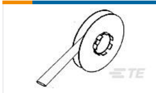
TE Part #721133-000 TTMS-4.8-4