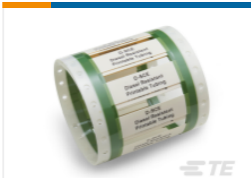
TE Part #762261-000 D-SCE Fluid Resistant Sleeves