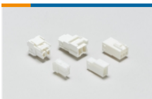
Rectangular Power Connectors(5)