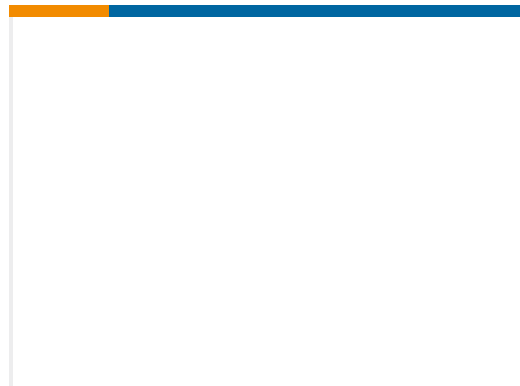
TE Part #1SNA103975R2100 FEDR63