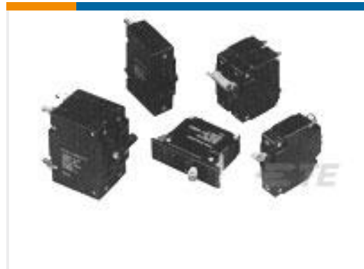
TE Part #3-1393253-2 W68-X2Q12-15=M6/M7/M9/W6/W7