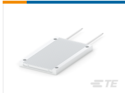
TE Part #1-2176248-2 TJT 250W 68R 5%