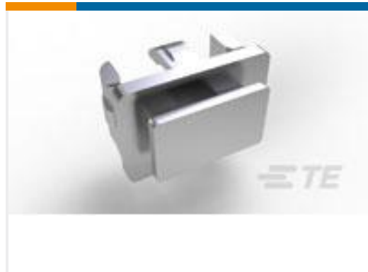
TE Part #1367147-3 SFP COVER, UNPL, NO LOGO