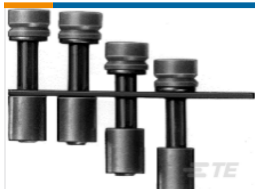
TE Part #1SNA176740R1100 BJMI5D-10