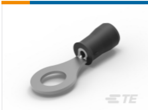
TE Part #320619 PIDG Ring Tongue Terminals