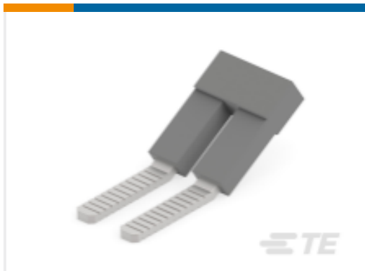
TE Part #1SNA113546R1400 PC6-2