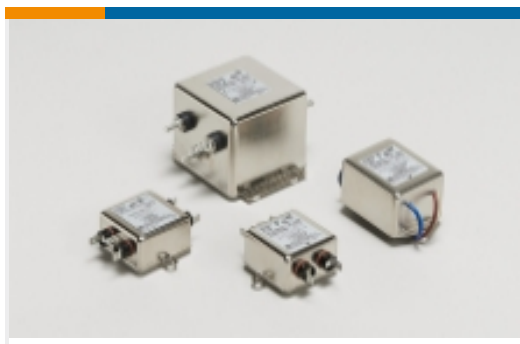
Single Phase Filters(13)